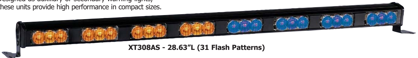
XT308AS - 28.63"L (31 Flash Patterns)