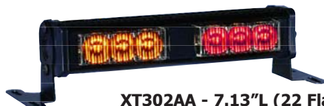
XT302AA - 7.13"L (22 Flash Patterns) XT3AH - 3.5"L (12 Flash Patterns)