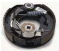
Brake Kit - LH

(K23-047-00) Complete 7" x 1-1/4" electric brake assembly. Left Hand.