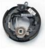
Brake Kit - LH

(K23-103-00) Complete 7" x 1-1/4" electric brake with park assembly. Left Hand.