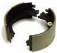
K71-502-00 Brake Shoe & Lining Kit - RH

Cast Backing Plate (approx date of April 2000)