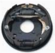
3500# Hydraulic Uni-servo Brake Assembly - LH

(K23-401-00) Complete 10" x 2-1/4" hydraulic duo-servo with park brake assembly. Right Hand