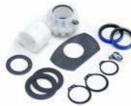
K71-101-00 Camshaft Repair Kit

Fits "P" style Dexter 10K-27K, 12-1/4" air brake axles. For one brake.