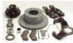
6K Disc Brake Retrofit Kit - LH

(K71-638-00) For Dexter 6,000 lb. axles. For one brake.