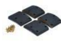
K71-102-00 Brake Block Kit

Fits Dexter 12-1/4 x 3-3/8", 12-1/4 x 4" and 12-1/4 x 5" brakes with 1-1/4" diameter cylinder (9K-12K).