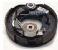
Brake Kit - RH

(K23-047-00) Complete 7" x 1-1/4" electric brake assembly. Left Hand.