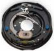
Brake Kit - LH

(K23-459-00) Complete 12" x 2" Electric 6000# Nev-R-Adjust. Right Hand