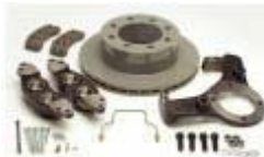
8K Disc Brake Retrofit Kit

(K71-639-00) For Dexter 6,000 lb. axles. For one brake.