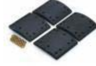
K71-138-00 Brake Block Kit