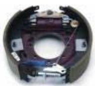
Brake Kit - LH

(K23-404-00) Complete 12-1/4" x 4" hydraulic 10K HD duo-servo FSA brake assembly. Left Hand.