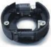
Brake Kit - LH

(K23-104-00) Complete 7" x 1-1/4" electric brake with park assembly. Right Hand.