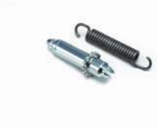
K71-398-00 Adjusting Screw & Spring

Fits Dexter 12 x 2" free backing hydraulic brakes.