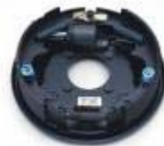
3500# Hydraulic Uni-servo Brake Assembly - RH

(K23-312-00) Complete 10" x 2-1/4" hydraulic uni-servo brake assembly. Left Hand.