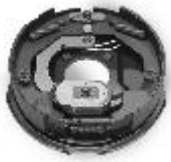
4400# Electric Brake Assembly - LH

(K23-345-01) Complete 10" x 2-1/4" hydraulic free backing corrosion resistant brake assembly (standard brake shown). Right Hand.