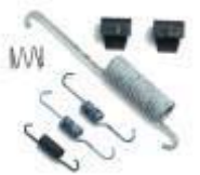
K71-361-00 Brake Spring Kit