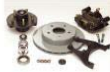
3.5K Disc Brake Retrofit Kit - RH

(K71-633-00) For Dexter 3,500 lb. axles. For one brake.