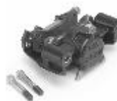
Caliper Replacement Kit for 3.5K disc - LH

(K71-635-00) For Dexter 8,000 lb. axles. For one brake. Unhanded. Required idler hubs are not included with this kit.