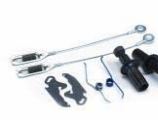
K71-418-00 Brake Adjuster Kit

For one Dexter 12-1/4 x 3-3/8", 12-1/4 x 4" and 12-1/4 x 5" hydraulic brake. (Prior to 2-97).