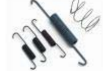
K71-412-00 Brake Spring Kit

For Dexter 10 x 2-1/4 and 12 x 2" electric brakes without parking feature.