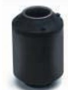
K71-370-00 Rubber Spring Eye Bushing

1/4 - 28 for .230/.235 diameter hole. Fits E-Z Lube spindles, shackle and hanger bolts.