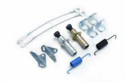
K71-472-00 Brake Adjuster Kit

For 12-1/4" hydraulic brakes. Services two brakes (8K-15K).