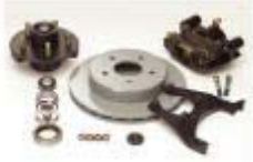
3.5K Disc Brake Retrofit Kit - LH

(K71-633-00) For Dexter 3,500 lb. axles. For one brake.