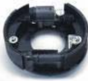
Brake Kits - RH

(K23-398-00) Complete 7" x 1-3/4" hydraulic uni-servo brake assembly. Left Hand.