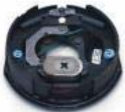
3500# Electric Brake Assembly - LH

(K23-026-00) Complete 10" x 2-1/4" electric brake assembly. Left Hand.