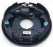
3500# Hydraulic Uni-servo Brake Assembly - LH

(K23-311-00) Complete 10" x 2 1/4" hydraulic duo-servo brake assembly. Right Hand