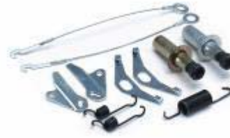
K71-465-00 Forward Self-Adjust Retrofit

Designed for tight clearance applications. Fits all Torflex axles.