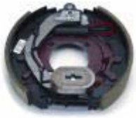
Brake Kit - LH

(K23-428-00) Complete 12-1/4" x 2-1/2" electric 7.2K manual adjust brake assembly. Left Hand.