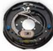
Brake Kit - RH

(K23-458-00) Complete 12" x 2" Electric 6000# Nev-R-Adjust. Left Hand