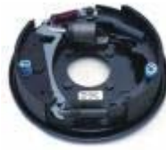
3500# Hydraulic Free Backing Brake Assembly - RH

(K23-345-00) Complete 10" x 2-1/4" hydraulic free backing brake assembly (standard brake shown). Right Hand.