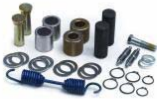
K71-098-00 Brake Shoe Hardware Kit

Fits "P" style Dexter 10K-27K, 12-1/4" air brake axles. For one brake.