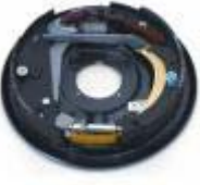
Brake Kit - LH

(K23-335-00) Complete 12" x 2" hydraulic 7000# uni-servo with park brake assembly. Right Hand.