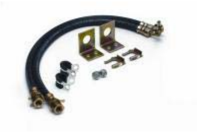
K71-461-00 Torflex 90-degree Hose Kit

Designed for tight clearance applications. Fits all Torflex axles.