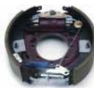
Brake Kit - RH

(K23-404-00) Complete 12-1/4" x 4" hydraulic 10K HD duo-servo FSA brake assembly. Left Hand.