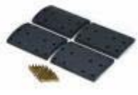
K71-133-00 Brake Block Kit