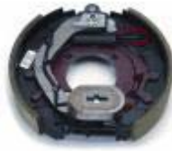
Brake Kit - RH

(K23-428-00) Complete 12-1/4" x 2-1/2" electric 7.2K manual adjust brake assembly. Left Hand.