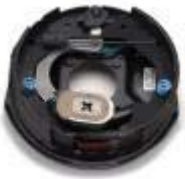
3500# Electric Brake Assembly with Park - LH

(K23-086-00) Complete 10" x 2-1/4" electric brake with park assembly for a D35 (3500#) axle. Left Hand