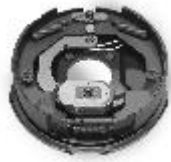
4400# Electric Brake Assembly - RH

(K23-454-00) Complete 10" x 2-1/4" electric brake assembly for a D44 (4400#) axle. Left Hand