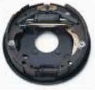
3500# Hydraulic Duo-servo Brake Assembly - LH