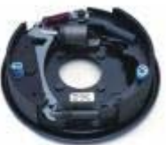
3500# Hydraulic Free Backing Brake Assembly - LH

(K23-331-00) Complete 10" x 2-1/4" hydraulic uni-servo (duo-servo shown) with park brake assembly. Right Hand.