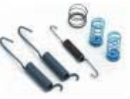
K71-363-00 Brake Spring Kit

For Dexter 10 x 2-1/4 and 12 x 2" electric brakes without parking feature.