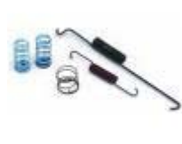
K71-362-00 Brake Spring Kit