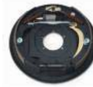
Brake Kit - RH

(K23-334-00) Complete 12" x 2" hydraulic 7000# uni-servo with park brake assembly. Left Hand.