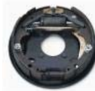
3500# Hydraulic Uni-servo Brake Assembly - RH

(K23-330-00) Complete 10" x 2-1/4" hydraulic uni-servo (duo-servo shown) with park brake assembly. Left Hand.