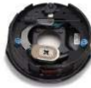
3500# Electric Brake Assembly with Park - RH

(K23-086-00) Complete 10" x 2-1/4" electric brake with park assembly for a D35 (3500#) axle. Left Hand