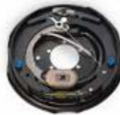
Brake Kit - RH

(K23-464-00) Complete 12" x 2" Electric 7000# Nev-R-Adjust. Left Hand