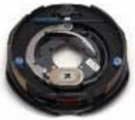
Brake Kit - RH

(K23-328-00) Complete 12" x 2" electric 6000# CSA with park brake assembly. Left Hand.