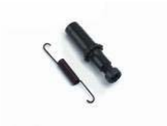
K71-411-00 Adjusting Screw & Spring

Contains extra heat shrink caps, magnet ret. clips, wire clips, plugs, wire grommets, and wire connectors for repairing Dexter brakes.