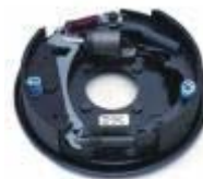
3500# Hydraulic Free Backing Brake Assembly - LH

(K23-344-00) Complete 10" x 2-1/4" hydraulic free backing brake assembly (standard brake shown). Left Hand.