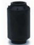
K71-372-00 Rubber Equalizer Bushing