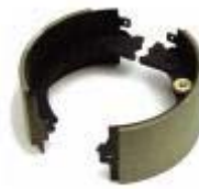
K71-503-00 Brake Shoe & Lining Kit - LH

Fits Dexter 12-1/4 x 5" electric brake (12K-15K).