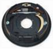
Brake Kit - LH

(K23-334-00) Complete 12" x 2" hydraulic 7000# uni-servo with park brake assembly. Left Hand.