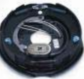
Brake Kit - LH

(K23-465-00) Complete 12" x 2" Electric 7000# Nev-R-Adjust. Right Hand