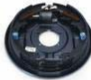
Brake Kit - LH

(K23-342-01) Complete 12" x 2" hydraulic 7000# free backing corrosion resistant brake assembly. Left Hand.