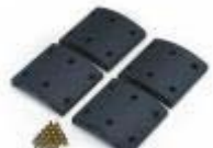
K71-152-00 Brake Block Kit