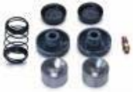
K71-081-00 Brake Cylinder Rebuild Kit

Fits Dexter 12-1/4 x 3-3/8", 12-1/4 x 4" and 12-1/4 x 5" brakes with 1-1/4" diameter cylinder (9K-12K).