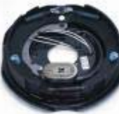
Brake Kit - RH

(K23-105-00) Complete 12" x 2" electric 5200# CSA brake assembly. Left Hand.