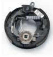
Brake Kit - RH

(K23-103-00) Complete 7" x 1-1/4" electric brake with park assembly. Left Hand.