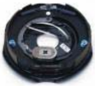
Brake Kit - RH

(K23-327-00) Complete 12" x 2" electric 6000# CSA brake assembly. Right Hand.