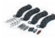
K71-180-00 Disc Brake Pad Kit