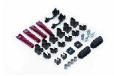
K71-399-00 Electric Brake Parts Kit

Fits Dexter 12 x 2" free backing hydraulic brakes.