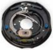
Brake Kit - LH

(K23-458-00) Complete 12" x 2" Electric 6000# Nev-R-Adjust. Left Hand