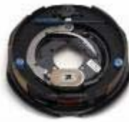
Brake Kit - LH

(K23-327-00) Complete 12" x 2" electric 6000# CSA brake assembly. Right Hand.