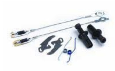
K71-417-00 Brake Adjuster Kit

Fits Dexter 12-1/4 x 2-1/2" electric brake (7.2K) and all 12-1/4" manual adjust electric brakes.