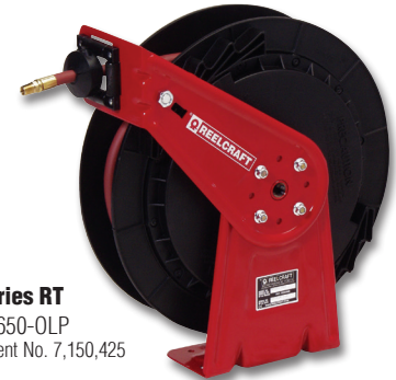
Series RT RT650-OLP Patent No. 7,150,425