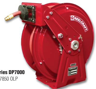
Series DP7000 DP7850 OLP

Many other sizes and models available as standard. Contact your local sales rep for more information.