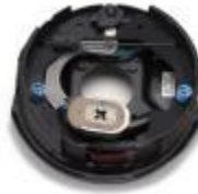
3500# Electric Brake Assembly with Park - RH

(K23-086-00) Complete 10" x 2-1/4" electric brake with park assembly for a D35 (3500#) axle. Left Hand