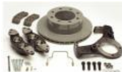
8K Disc Brake Retrofit Kit

(K71-639-00) For Dexter 6,000 lb. axles. For one brake.