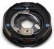
Brake Kit - RH

(K23-328-00) Complete 12" x 2" electric 6000# CSA with park brake assembly. Left Hand.