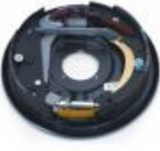
Brake Kit - LH

(K23-335-00) Complete 12" x 2" hydraulic 7000# uni-servo with park brake assembly. Right Hand.