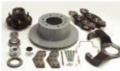
6K Disc Brake Retrofit Kit - RH

(K71-634-00) For Dexter 3,500 lb. axles. For one brake.