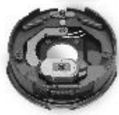
4400# Electric Brake Assembly - RH

(K23-454-00) Complete 10" x 2-1/4" electric brake assembly for a D44 (4400#) axle. Left Hand