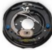
Brake Kit - RH

(K23-458-00) Complete 12" x 2" Electric 6000# Nev-R-Adjust. Left Hand