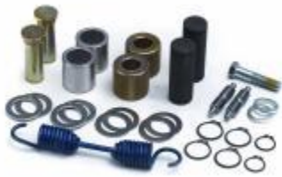
K71-098-00 Brake Shoe Hardware Kit

Fits "P" style Dexter 10K-27K, 12-1/4" air brake axles. For one brake.