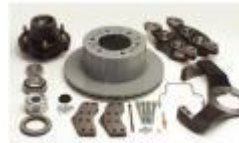
6K Disc Brake Retrofit Kit - LH

(K71-638-00) For Dexter 6,000 lb. axles. For one brake.