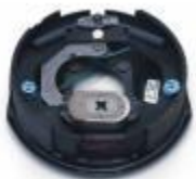
3500# Electric Brake Assembly - LH