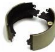
K71-503-00 Brake Shoe & Lining Kit - LH

Fits Dexter 12-1/4 x 5" electric brake (12K-15K).