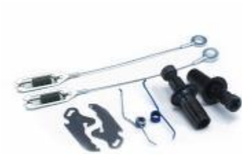
K71-418-00 Brake Adjuster Kit

For one Dexter 12-1/4 x 3-3/8", 12-1/4 x 4" and 12-1/4 x 5" hydraulic brake. (Prior to 2-97).