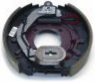
Brake Kit - LH

(K23-428-00) Complete 12-1/4" x 2-1/2" electric 7.2K manual adjust brake assembly. Left Hand.