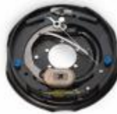
Brake Kit - RH

(K23-464-00) Complete 12" x 2" Electric 7000# Nev-R-Adjust. Left Hand