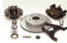
3.5K Disc Brake Retrofit Kit - RH

(K71-633-00) For Dexter 3,500 lb. axles. For one brake.