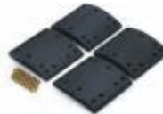
K71-138-00 Brake Block Kit