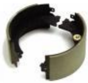
K71-502-00 Brake Shoe & Lining Kit - RH

Cast Backing Plate (approx date of April 2000)