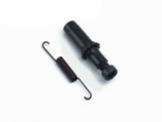
K71-411-00 Adjusting Screw & Spring

Contains extra heat shrink caps, magnet ret. clips, wire clips, plugs, wire grommets, and wire connectors for repairing Dexter brakes.