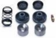
K71-081-00 Brake Cylinder Rebuild Kit

Fits Dexter 12-1/4 x 3-3/8", 12-1/4 x 4" and 12-1/4 x 5" brakes with 1-1/4" diameter cylinder (9K-12K).