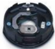
3500# Electric Brake Assembly - RH

(K23-026-00) Complete 10" x 2-1/4" electric brake assembly. Left Hand.