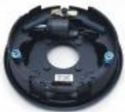
3500# Hydraulic Uni-servo Brake Assembly - LH

(K23-311-00) Complete 10" x 2 1/4" hydraulic duo-servo brake assembly. Right Hand