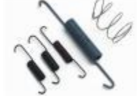
K71-412-00 Brake Spring Kit

For Dexter 10 x 2-1/4 and 12 x 2" electric brakes without parking feature.