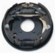
3500# Hydraulic Uni-servo Brake Assembly - LH

(K23-401-00) Complete 10" x 2-1/4" hydraulic duo-servo with park brake assembly. Right Hand