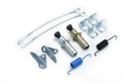
K71-472-00 Brake Adjuster Kit

For 12-1/4" hydraulic brakes. Services two brakes (8K-15K).