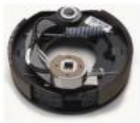
Brake Kit - LH

(K23-047-00) Complete 7" x 1-1/4" electric brake assembly. Left Hand.