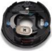
3500# Electric Brake Assembly with Park - LH

(K23-086-00) Complete 10" x 2-1/4" electric brake with park assembly for a D35 (3500#) axle. Left Hand