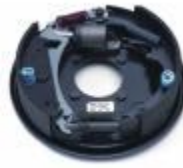
3500# Hydraulic Free Backing Brake Assembly - RH

(K23-345-00) Complete 10" x 2-1/4" hydraulic free backing brake assembly (standard brake shown). Right Hand.