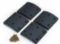
K71-152-00 Brake Block Kit