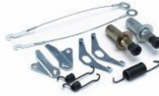
K71-465-00 Forward Self-Adjust Retrofit

Designed for tight clearance applications. Fits all Torflex axles.