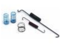
K71-362-00 Brake Spring Kit