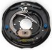
Brake Kit - LH

(K23-458-00) Complete 12" x 2" Electric 6000# Nev-R-Adjust. Left Hand