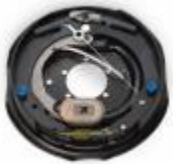
Brake Kit - LH

(K23-459-00) Complete 12" x 2" Electric 6000# Nev-R-Adjust. Right Hand