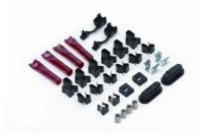
K71-399-00 Electric Brake Parts Kit

Fits Dexter 12 x 2" free backing hydraulic brakes.