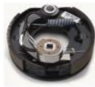
Brake Kit - RH

(K23-047-00) Complete 7" x 1-1/4" electric brake assembly. Left Hand.