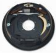
Brake Kit - LH

(K23-334-00) Complete 12" x 2" hydraulic 7000# uni-servo with park brake assembly. Left Hand.