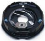
Brake Kit - RH

(K23-327-00) Complete 12" x 2" electric 6000# CSA brake assembly. Right Hand.