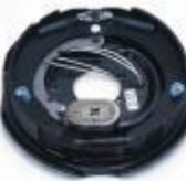
Brake Kit - RH

(K23-105-00) Complete 12" x 2" electric 5200# CSA brake assembly. Left Hand.