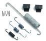
K71-361-00 Brake Spring Kit