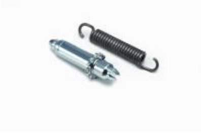
K71-398-00 Adjusting Screw & Spring

Fits Dexter 12 x 2" free backing hydraulic brakes.