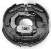
4400# Electric Brake Assembly - LH

(K23-345-01) Complete 10" x 2-1/4" hydraulic free backing corrosion resistant brake assembly (standard brake shown). Right Hand.