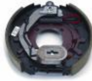
Brake Kit - RH

(K23-428-00) Complete 12-1/4" x 2-1/2" electric 7.2K manual adjust brake assembly. Left Hand.