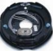
Brake Kit - LH

(K23-465-00) Complete 12" x 2" Electric 7000# Nev-R-Adjust. Right Hand