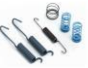
K71-363-00 Brake Spring Kit

For Dexter 10 x 2-1/4 and 12 x 2" electric brakes without parking feature.