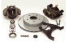
3.5K Disc Brake Retrofit Kit - LH

(K71-633-00) For Dexter 3,500 lb. axles. For one brake.