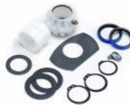
K71-101-00 Camshaft Repair Kit

Fits "P" style Dexter 10K-27K, 12-1/4" air brake axles. For one brake.