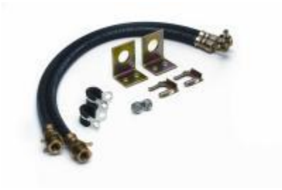
K71-461-00 Torflex 90-degree Hose Kit

Designed for tight clearance applications. Fits all Torflex axles.