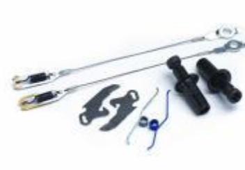
K71-417-00 Brake Adjuster Kit

Fits Dexter 12-1/4 x 2-1/2" electric brake (7.2K) and all 12-1/4" manual adjust electric brakes.