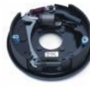
3500# Hydraulic Free Backing Brake Assembly - LH

(K23-344-00) Complete 10" x 2-1/4" hydraulic free backing brake assembly (standard brake shown). Left Hand.