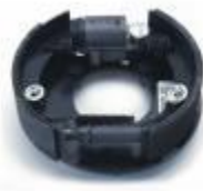
Brake Kits - RH

(K23-398-00) Complete 7" x 1-3/4" hydraulic uni-servo brake assembly. Left Hand.