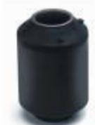
K71-370-00 Rubber Spring Eye Bushing

1/4 - 28 for .230/.235 diameter hole. Fits E-Z Lube spindles, shackle and hanger bolts.