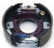
Brake Kit - LH

(K23-404-00) Complete 12-1/4" x 4" hydraulic 10K HD duo-servo FSA brake assembly. Left Hand.