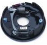
3500# Hydraulic Free Backing Brake Assembly - LH

(K23-331-00) Complete 10" x 2-1/4" hydraulic uni-servo (duo-servo shown) with park brake assembly. Right Hand.