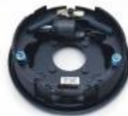
3500# Hydraulic Uni-servo Brake Assembly - RH

(K23-312-00) Complete 10" x 2-1/4" hydraulic uni-servo brake assembly. Left Hand.