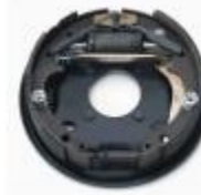
3500# Hydraulic Uni-servo Brake Assembly - RH

(K23-330-00) Complete 10" x 2-1/4" hydraulic uni-servo (duo-servo shown) with park brake assembly. Left Hand.