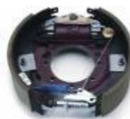
Brake Kit - RH

(K23-404-00) Complete 12-1/4" x 4" hydraulic 10K HD duo-servo FSA brake assembly. Left Hand.